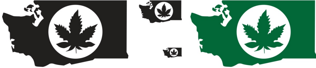
Produced in Washington Icon 3" / 1" / .5" / green